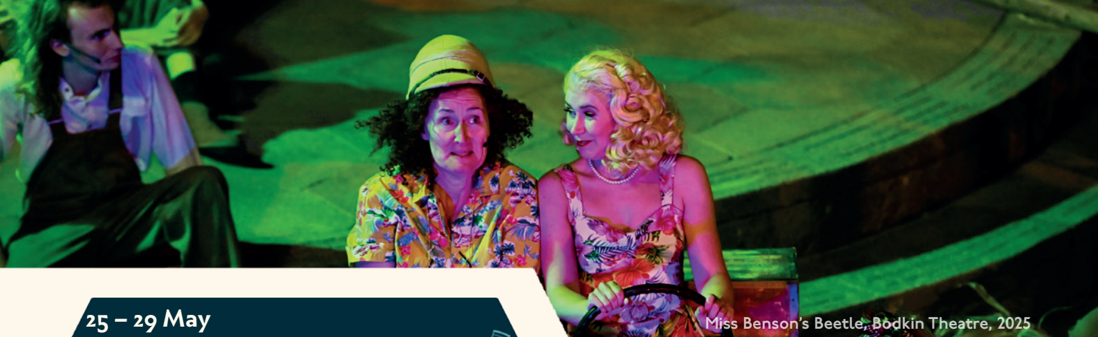
Miss Benson's Beetle, Bodkin Theatre, 2025