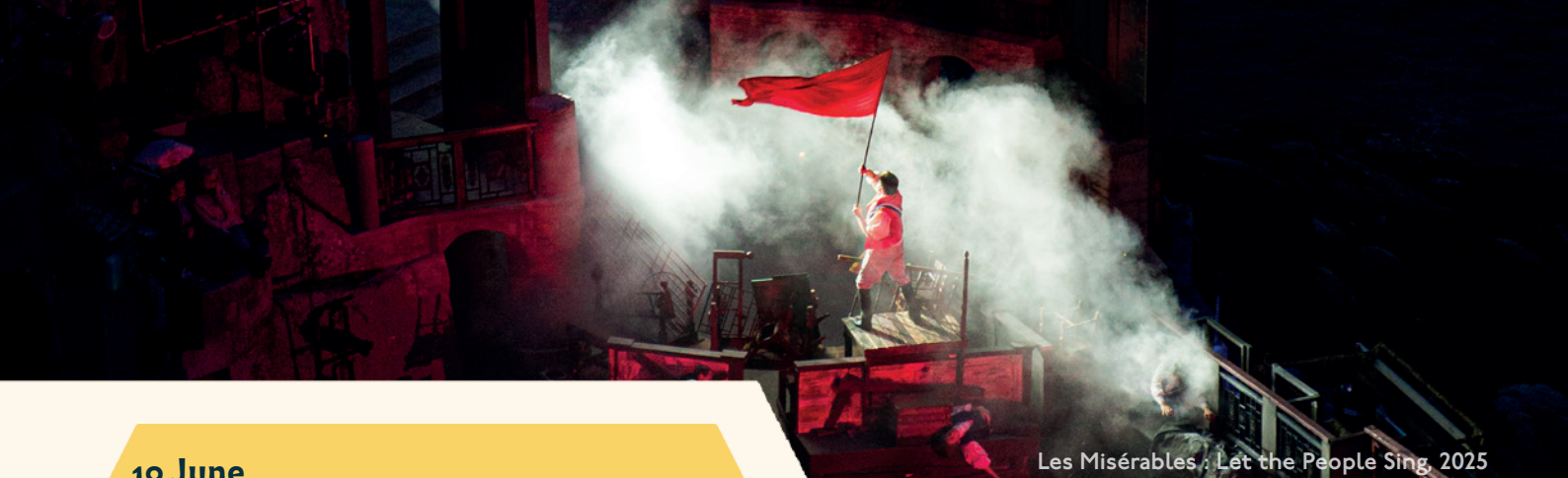
Les Misérables : Let the People Sing, 2025