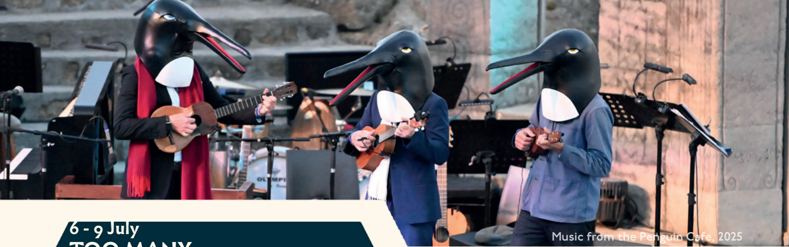
Music from the Penguin Cafe, 2025