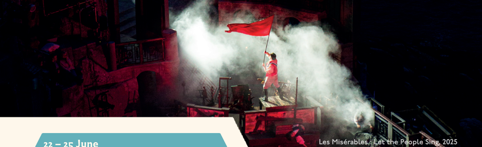
Les Misérables : Let the People Sing, 2025