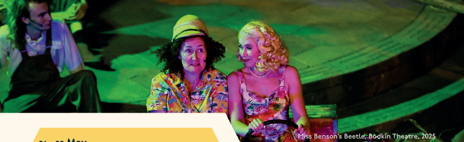
Miss Benson's Beetle, Bodkin Theatre, 2025